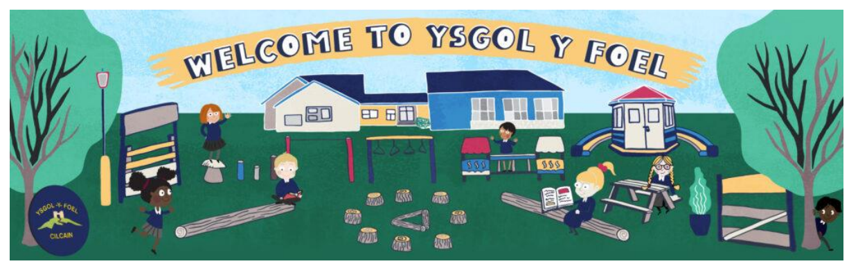
'FOEL' Fun, Outstanding, Enriched Learners Hwyl, Rhagorol, Cyfoethogi Dysgwyr